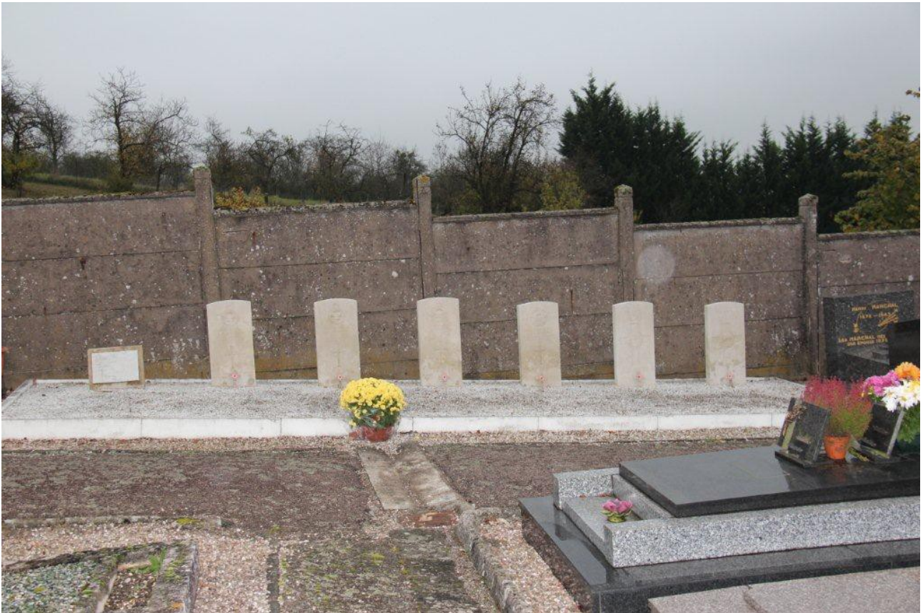
Essey cemetery in 2013