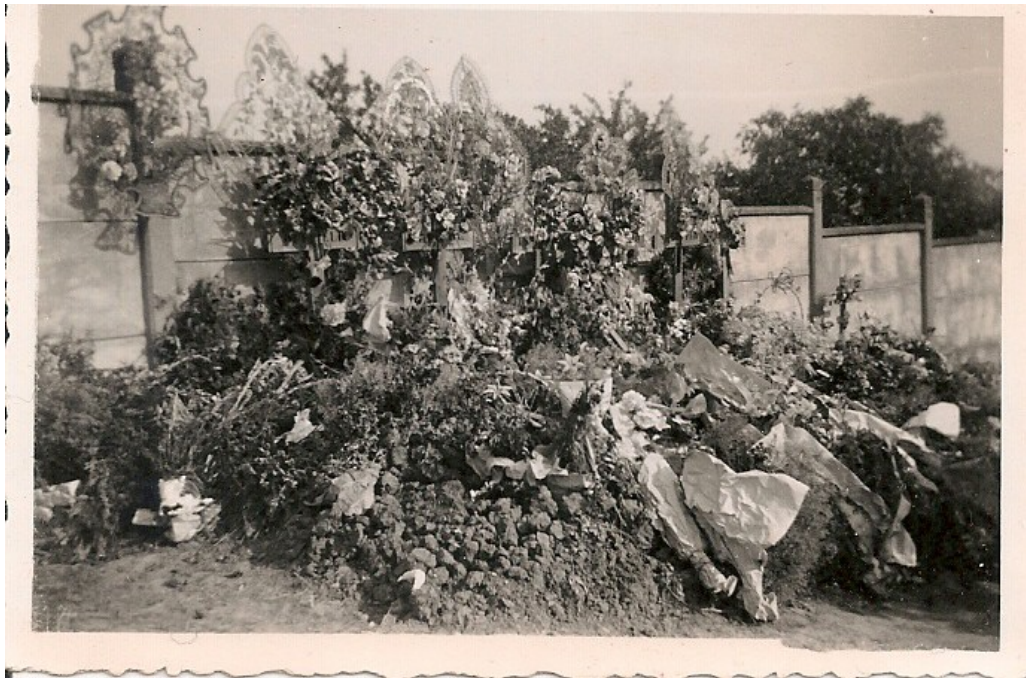
La population a largement fleuri les tombes des aviateurs, au cimetiere de Essey, malgré l'interdiction